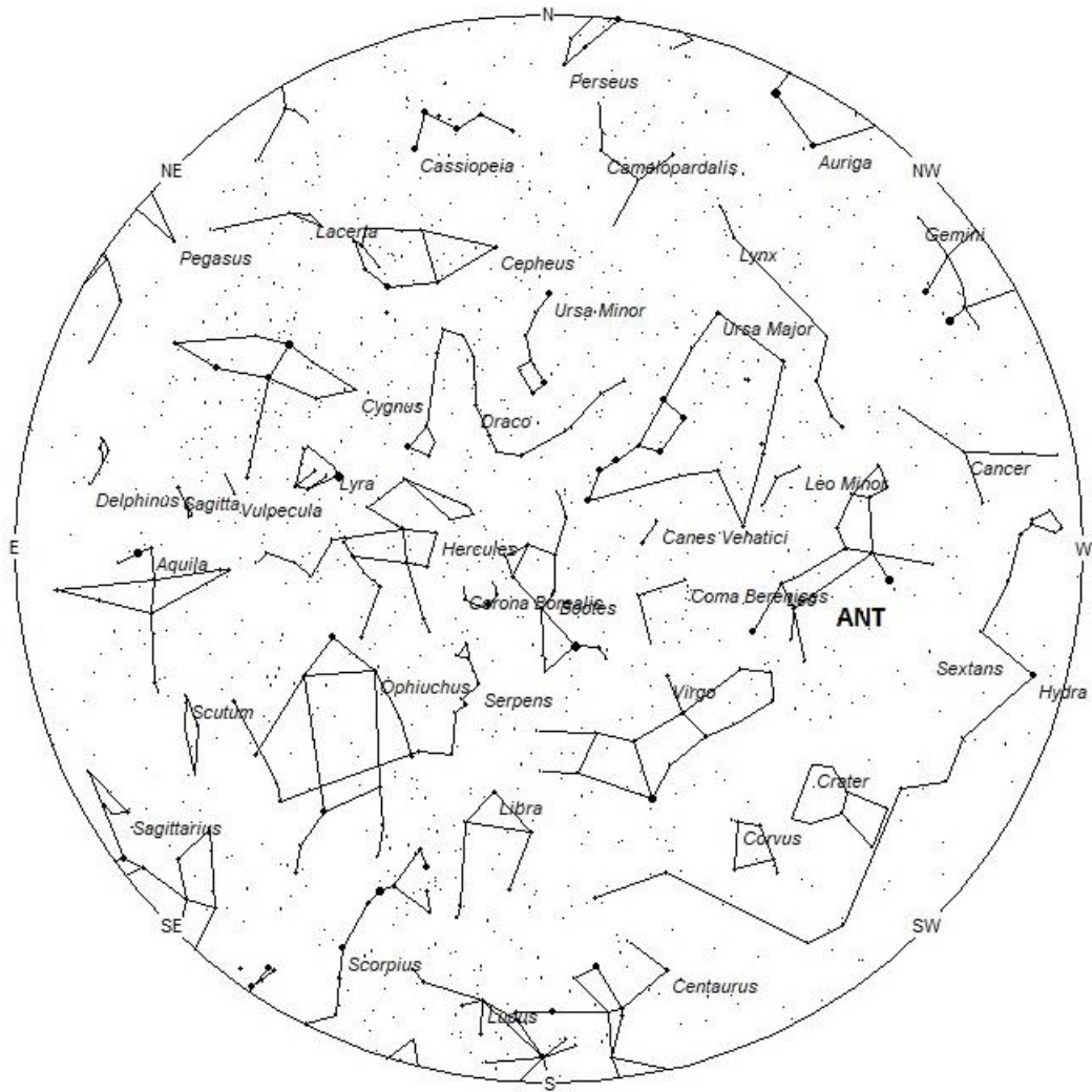
Radiant Positions at 5am Local Standard Time